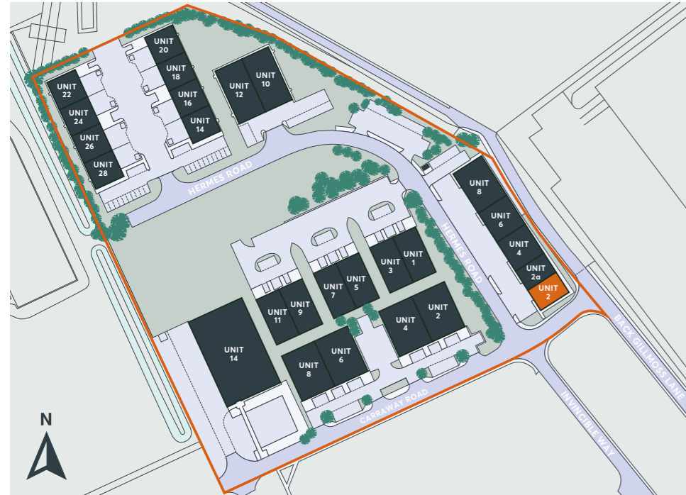
Site plan is indicative.