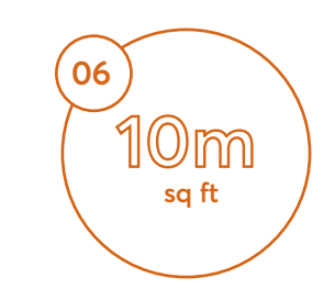
Of warehouse space across 50 parks nationwide