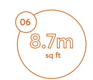
Of warehouse space spanning 50 parks nationwide